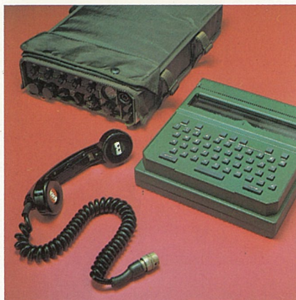
Other versions of MEROD are available with different parameters to meet specific requirements.