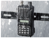
Water Resistance test

! Icom radios marked "Made in China" or made in another country are 100% fake. * Accessories such as batteries, chargers, microphones and other items may be made in other countries.